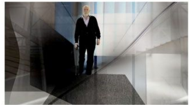
stills Frozen Hope , video film, 13:03 min, 2013